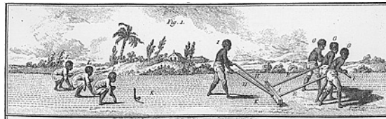
Workers prepare field for planting indigo.

with a gentle stirring a proportionate quantity of lime-water poured on, which brings about the precipitation of the indigo; when this is fallen to the consistency of a thick broth, the water standing above (now clear) is drawn off, and the sediment put into bags and hung up, until the moisture has largely come away. Finally this mass is taken out of the bags, kneaded on boards and wooden spades, divided into little cakes, and thoroughly dried, regard being had to the morning and evening sun. The preparation of indigo, which here and there is carried on with certain variations, is on the whole a chemical process requiring the most careful and exact attention in all its parts, the essential depending always on the right use of the proper moment, at which this or that should be done: The quality of the indigo is as much due to the exactness of its preparation as to the nature of the plant, of the soil, and of the weather. Hence indigo planters have not always equally good fortune, and often lose by the unskilfulness, malice, or carelessness of their head-men and workmen, much or the whole of a crop. The headmen in this sort of work are commonly negroes, and if they thoroughly understand the management of the indigo, a great value is set upon them, and they often fetch two or three times as much as they would ordinarily.