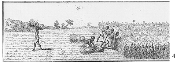
Harvesting indigo crop

In the average it is expected that an acre of land will yield 50 pounds of indigo, but very good land 60-70 pounds. Sundry marks determine the quality of the indigo in the eyes of those skilled; its lighter or darker, even and pure color, and the fineness of its particles, are exterior indications by which the practiced eye fixes the value: besides, the best sort must float in water and quite dissolve, and in the fire be consumed entirely; the more it departs from these peculiarities, the less good and genuine it is held to be. After rice, indigo is the chief staple of Carolina, and the yearly production and export reaches several 100,000 pounds' weight. Its cultivation may and will increase, since there is no lack of suitable land, nor is any great capital necessary for a first beginning. At Charleston a pound at this time, according to its condition, brings 3-5-7 shillings sterling: but neither in quality nor in price is the South Carolina indigo equal to that from the Mississippi, the West Indies, or South America. Besides that mentioned as most usually raised, the "false Guatemala," there is cultivated here and there in Carolina the French or