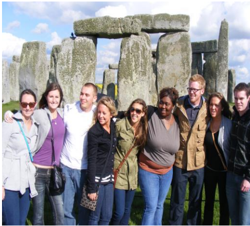
Wall Fellows Class of 2013 at Stonehenge