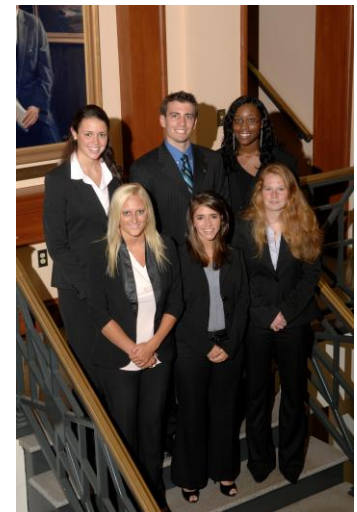
Wall Fellows Class of 2014